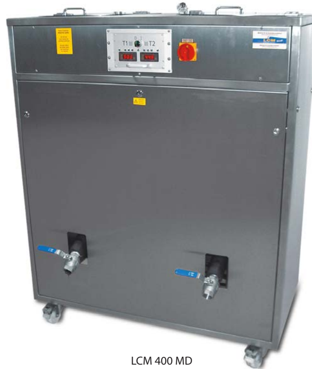
LCM 400 MD

The chocolate melting containers are easily cleaned. The high quality insulation of the tanks keep the energy costs at a minimum.