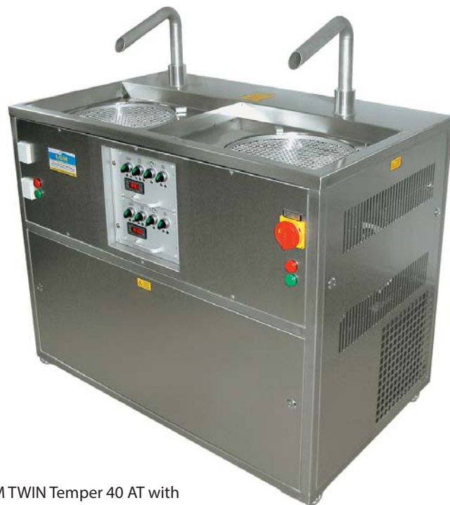
LCM TWIN Temper 40 AT with 2 x LCM 400 M Melting Container